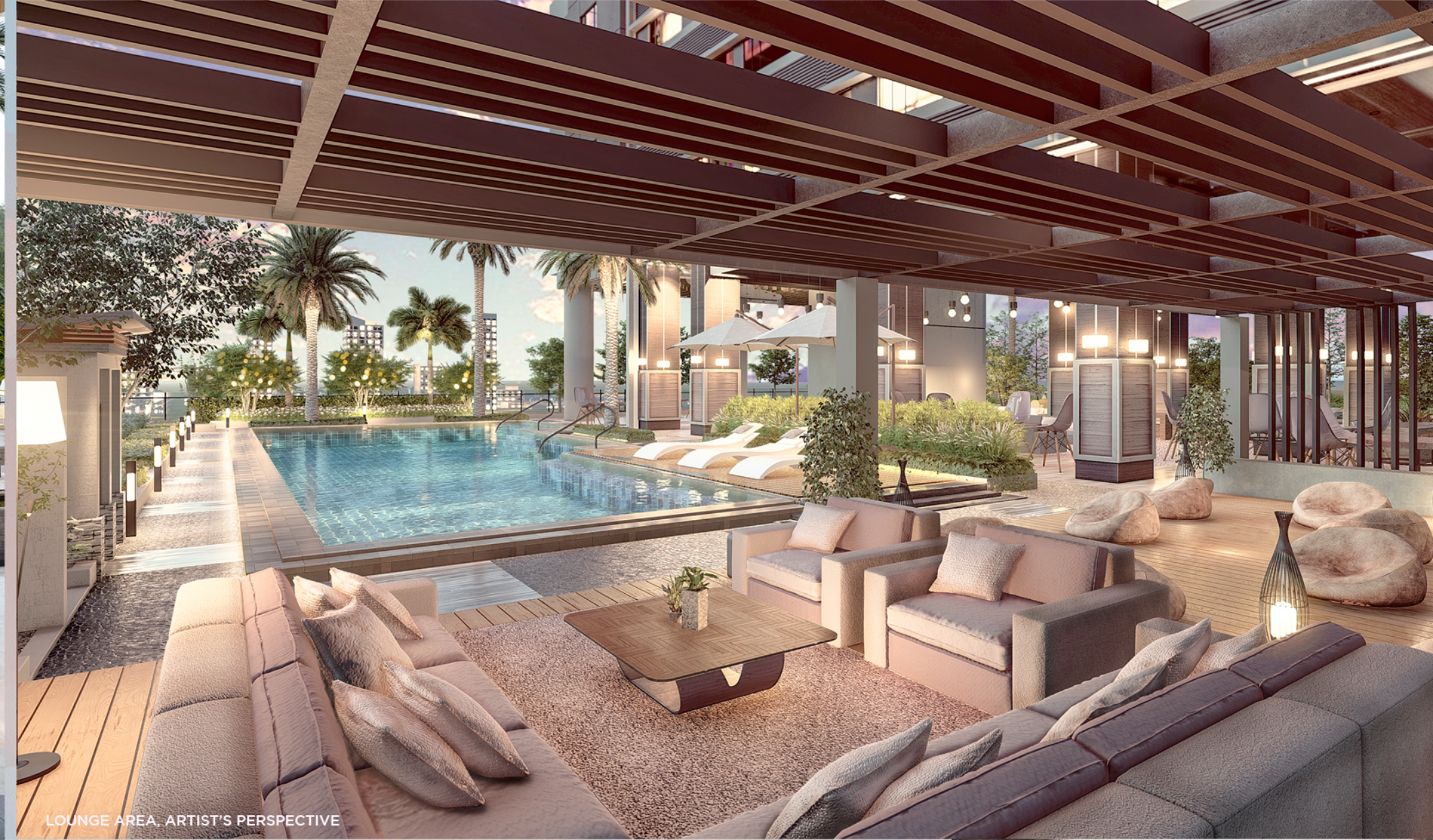
LOUNGE AREA, ARTIST'S PERSPECTIVE