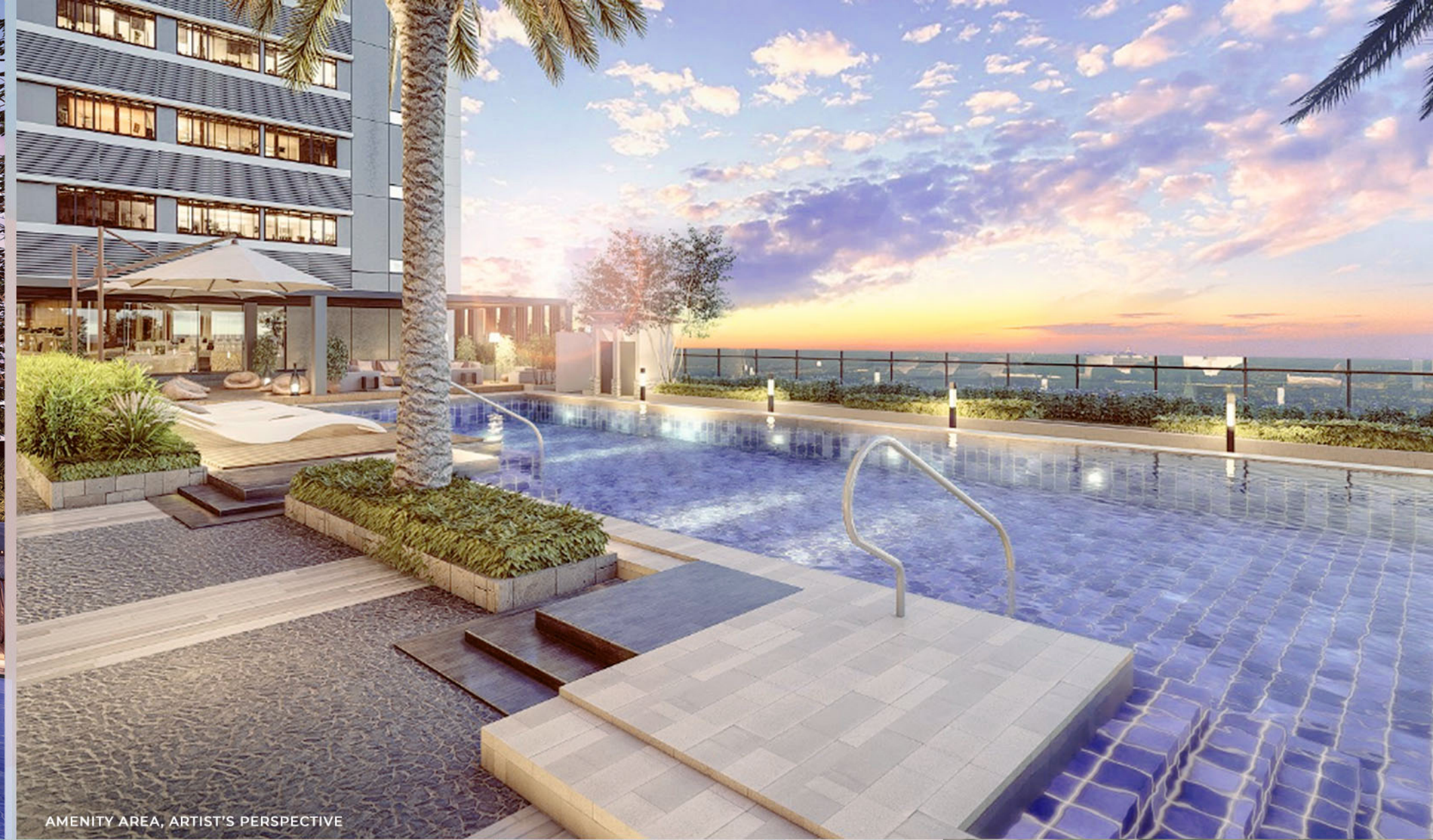
AMENITY AREA, ARTIST'S PERSPECTIVE