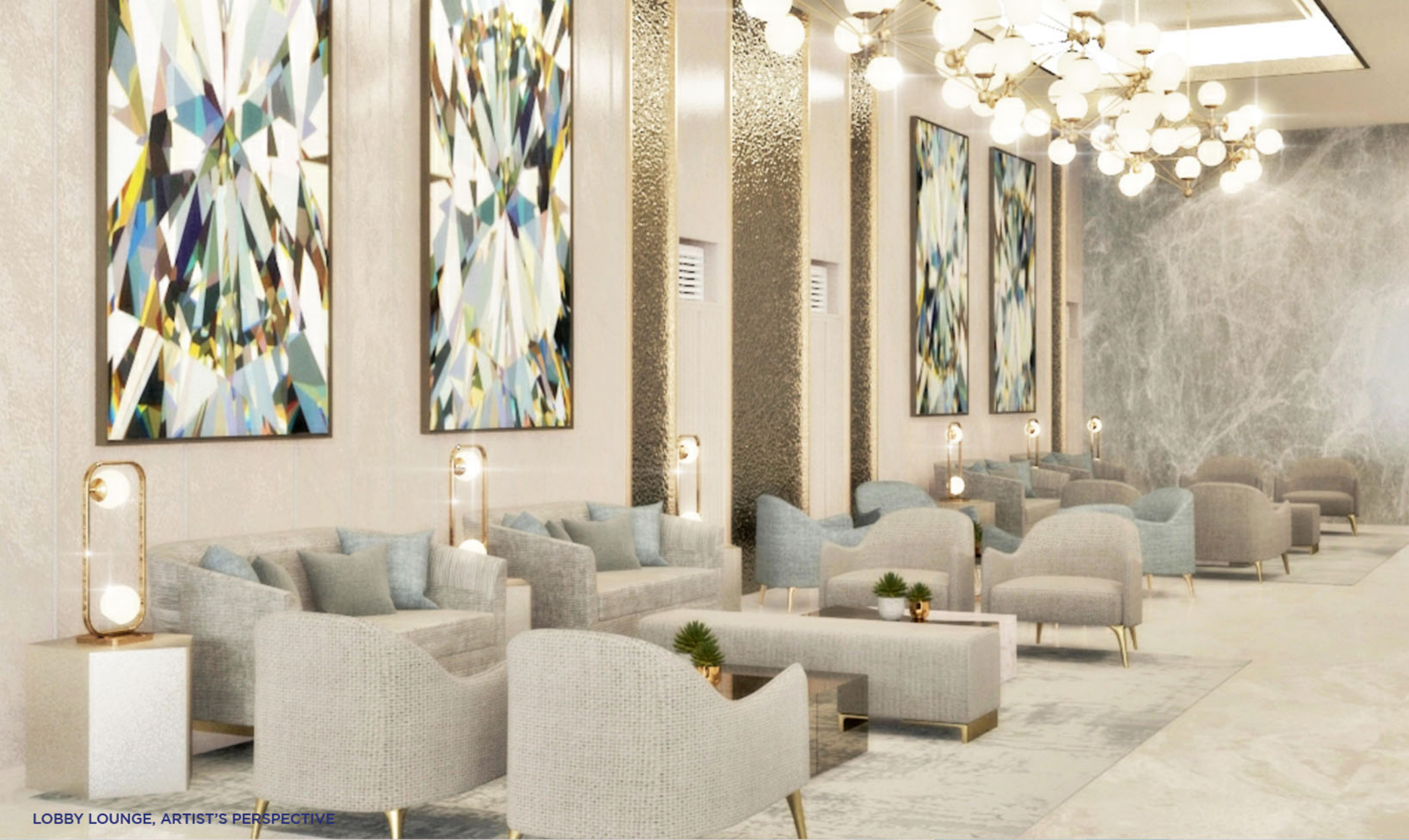
LOBBY LOUNGE, ARTIST'S PERSPECTIVE