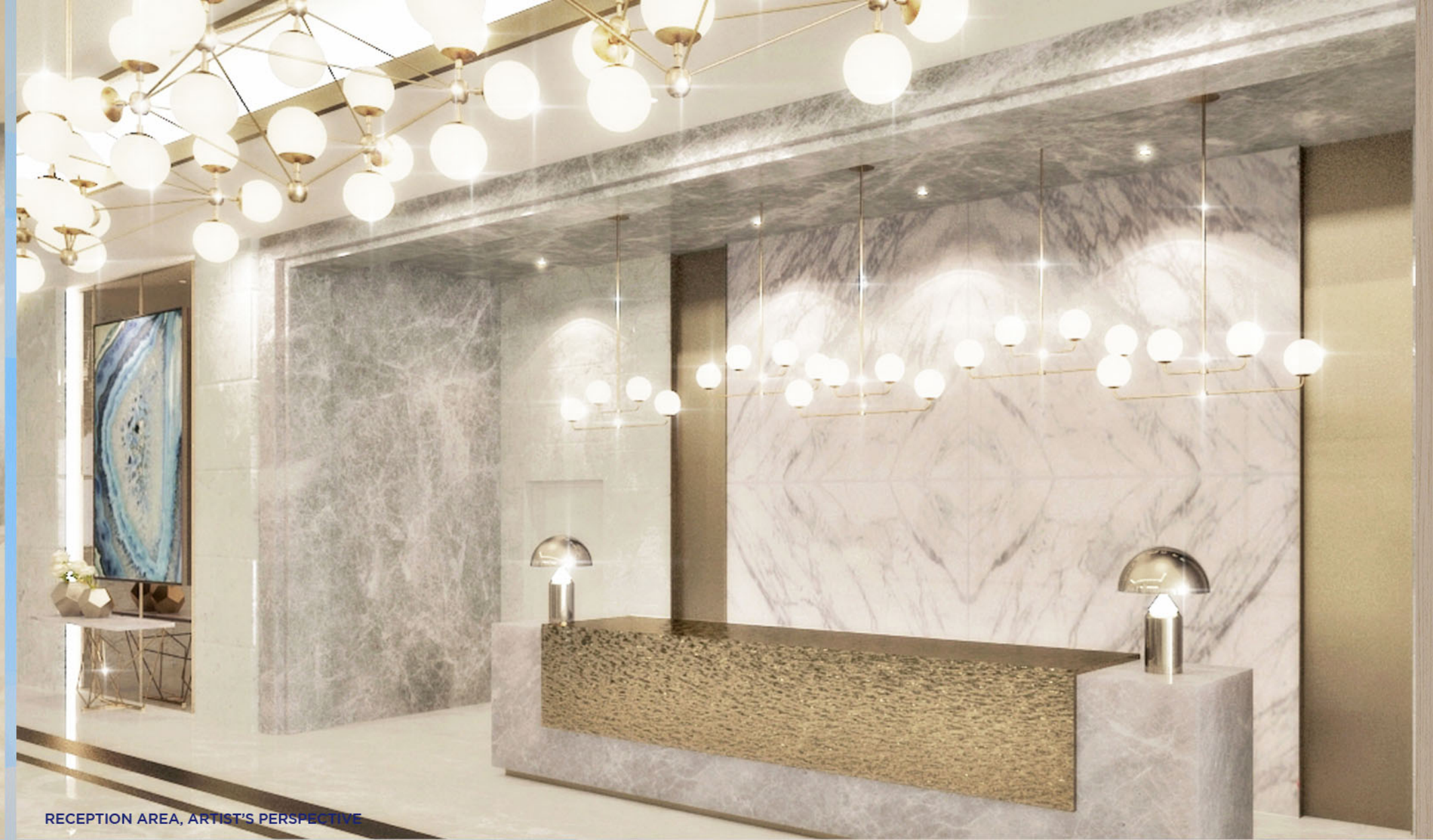
RECEPTION AREA, ARTIST'S PERSPECTIVE