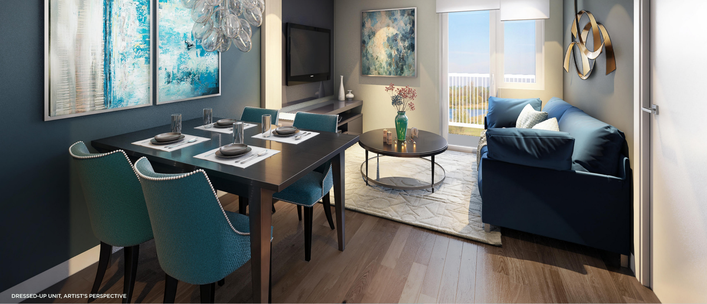
DRESSED-UP UNIT, ARTIST'S PERSPECTIVE