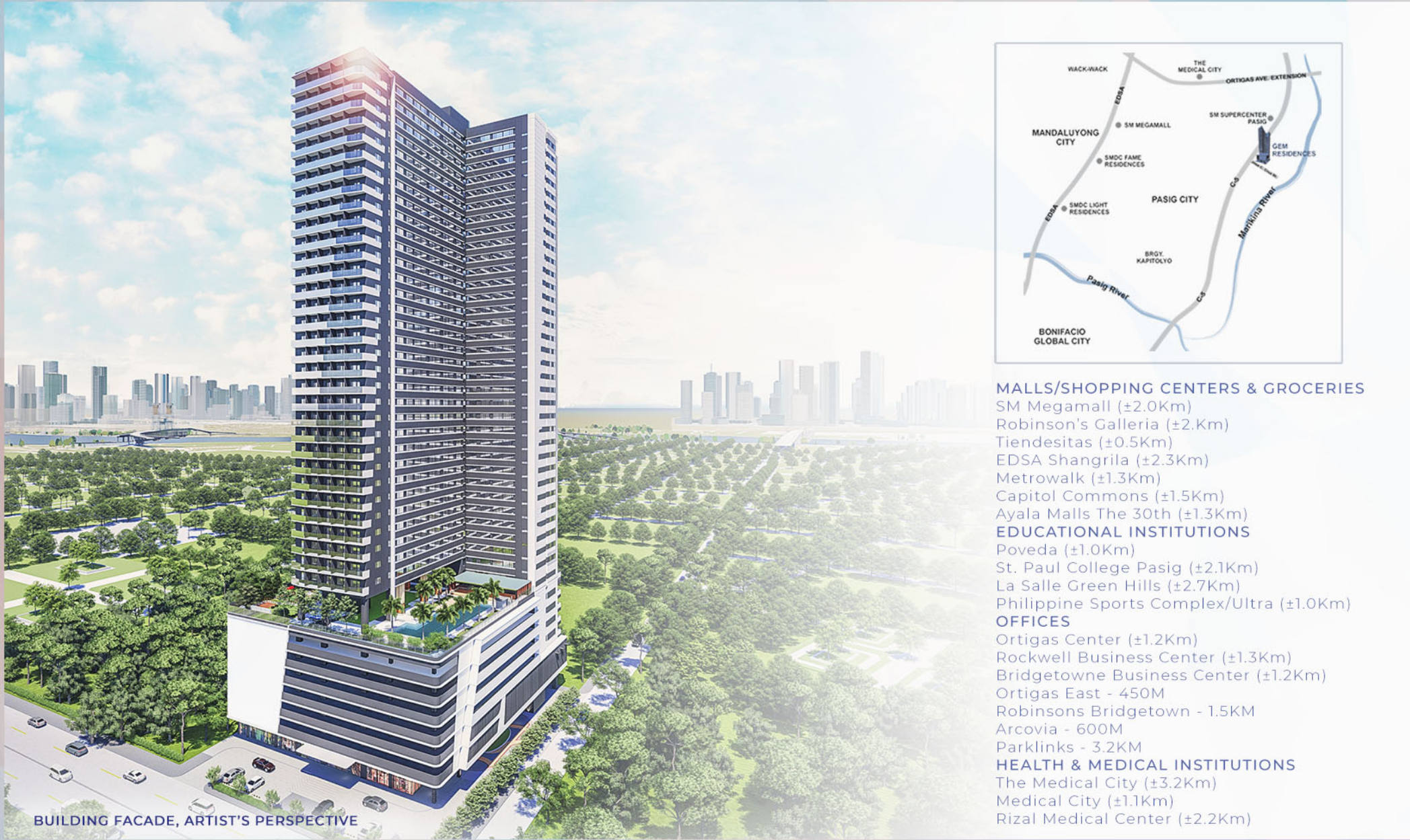
BUILDING FACADE, ARTIST'S PERSPECTIVE

Gem Residences perfectly captures your modern aspiration for work-life integration. Standing gorgeously along C5-Pasig, the thriving center of economic activity east of Metro Manila, Gem Residences brings you world-class amenities that cater to your need for both productivity and leisure. A living space that is purposely designed to bring together life's various facets (family, work, hobbies, and me-time) in one seamless fusion in order to achieve balance and wellness to its residents.