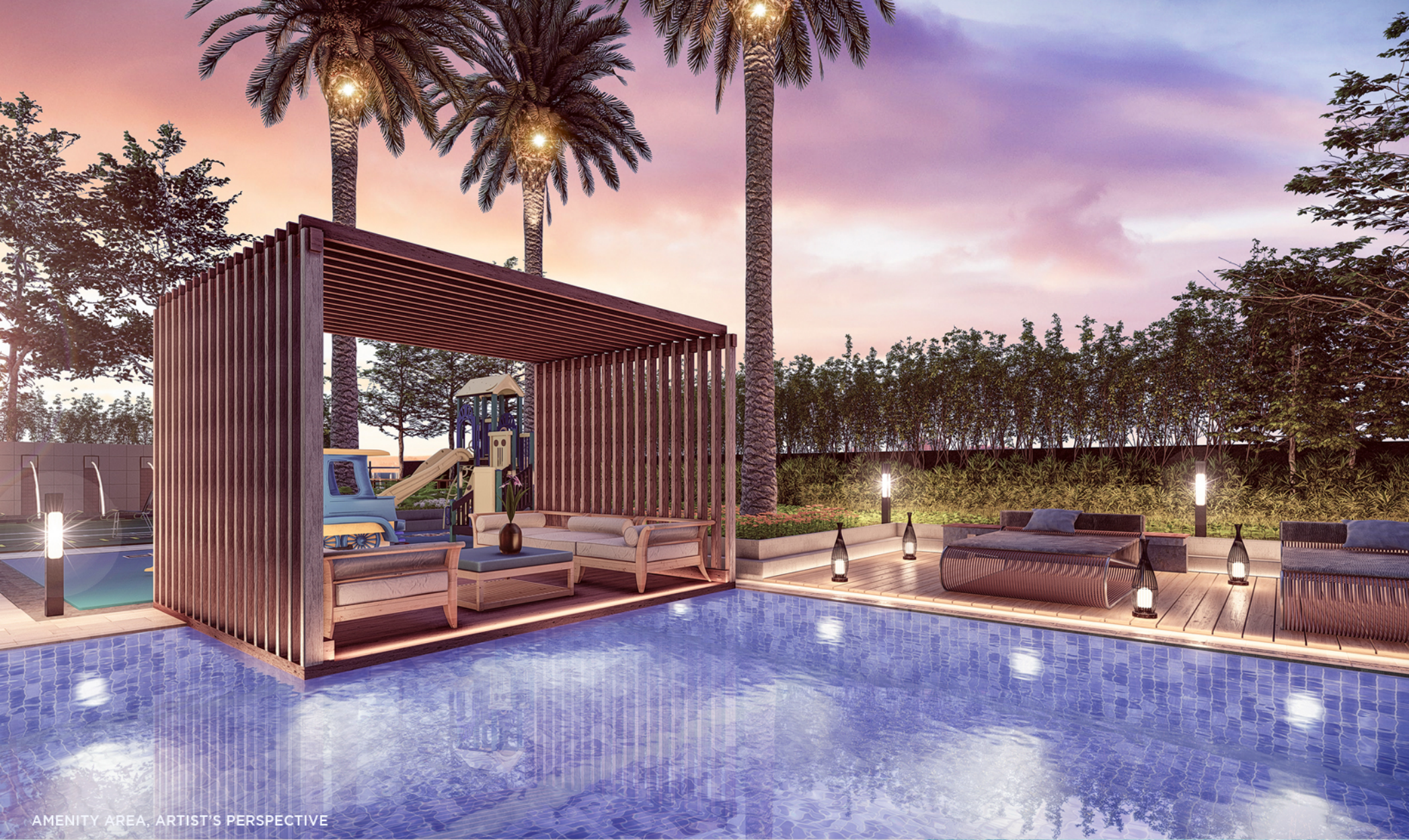
AMENITY AREA, ARTIST'S PERSPECTIVE