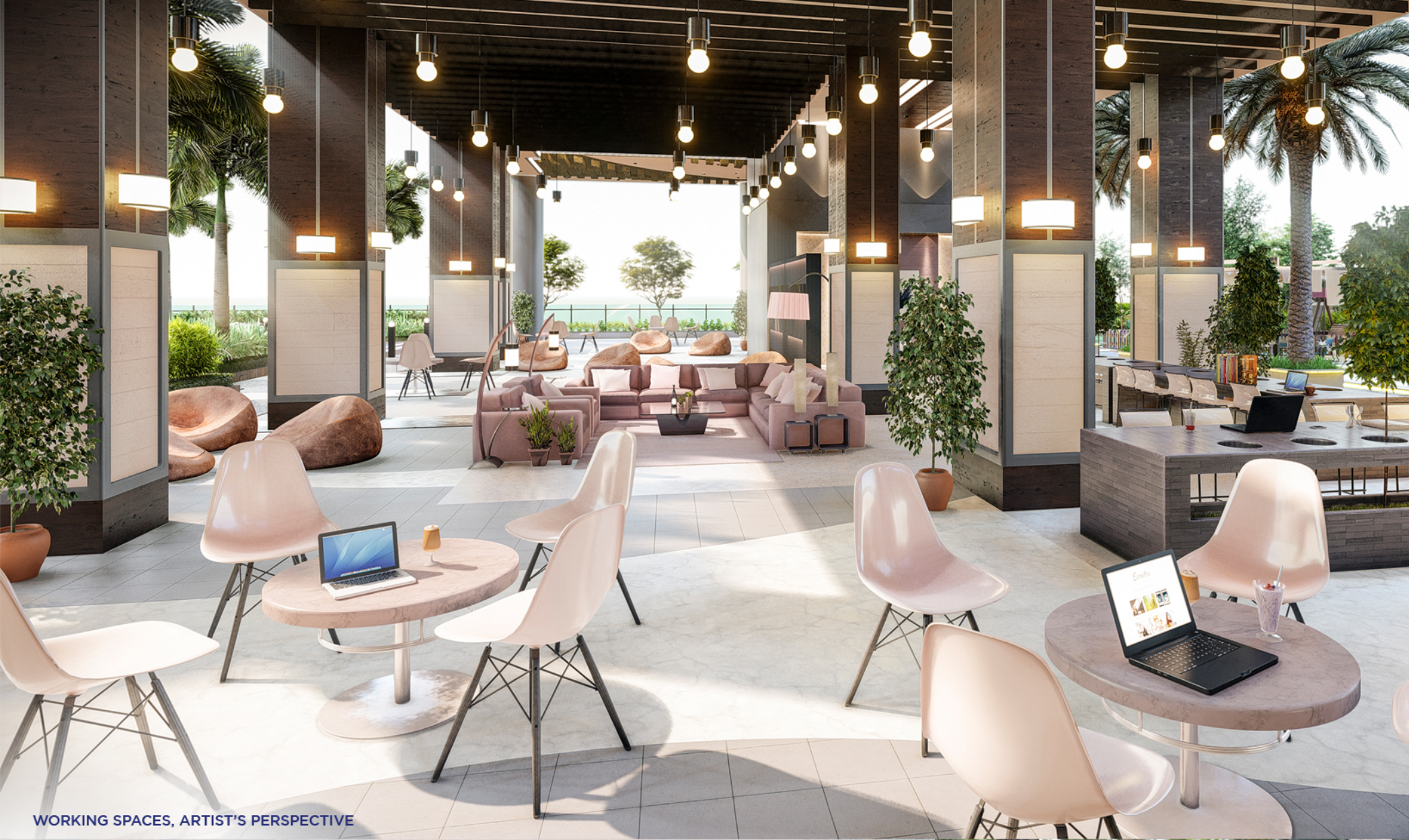
WORKING SPACES, ARTIST'S PERSPECTIVE