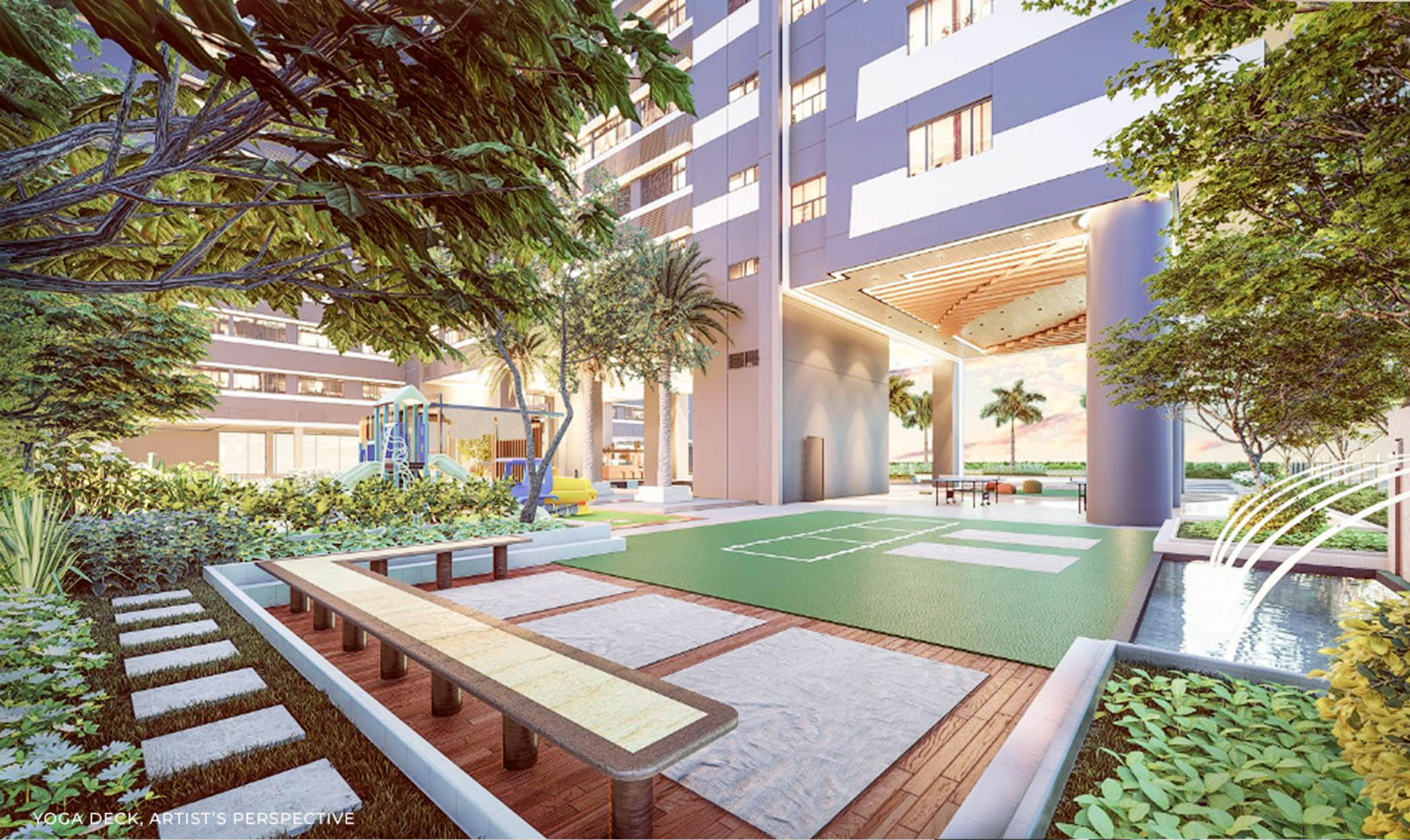
YOGA DECK, ARTIST'S PERSPECTIVE