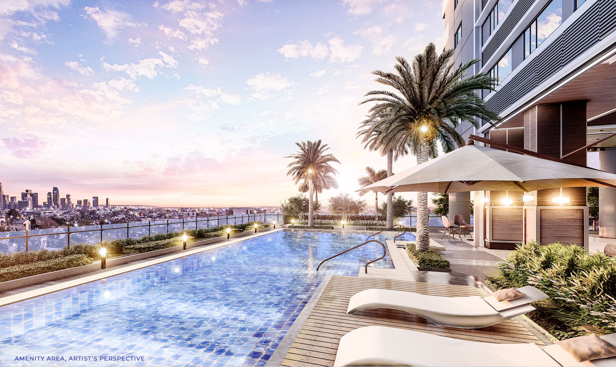
AMENITY AREA, ARTIST'S PERSPECTIVE