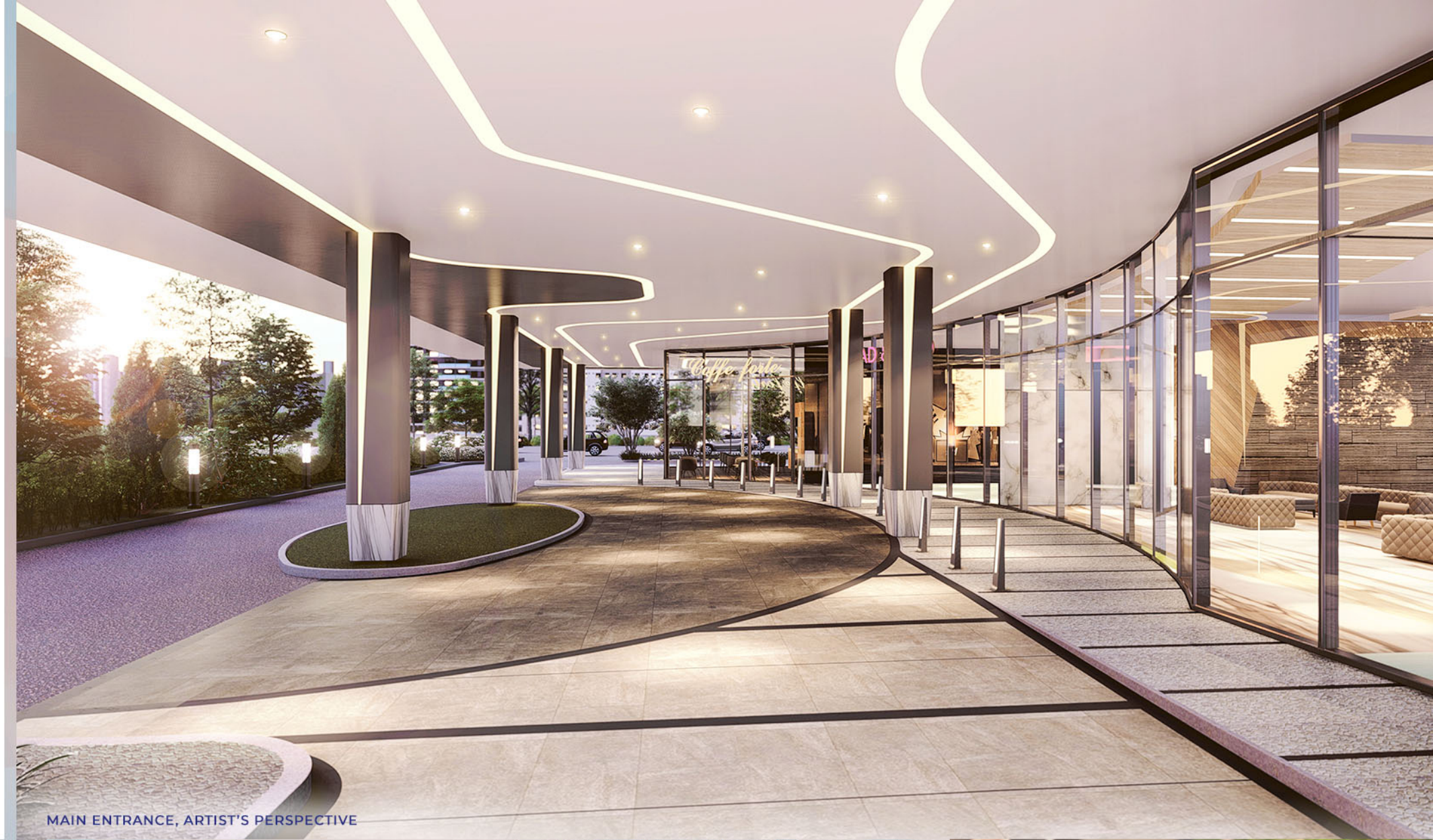
MAIN ENTRANCE, ARTIST'S PERSPECTIVE