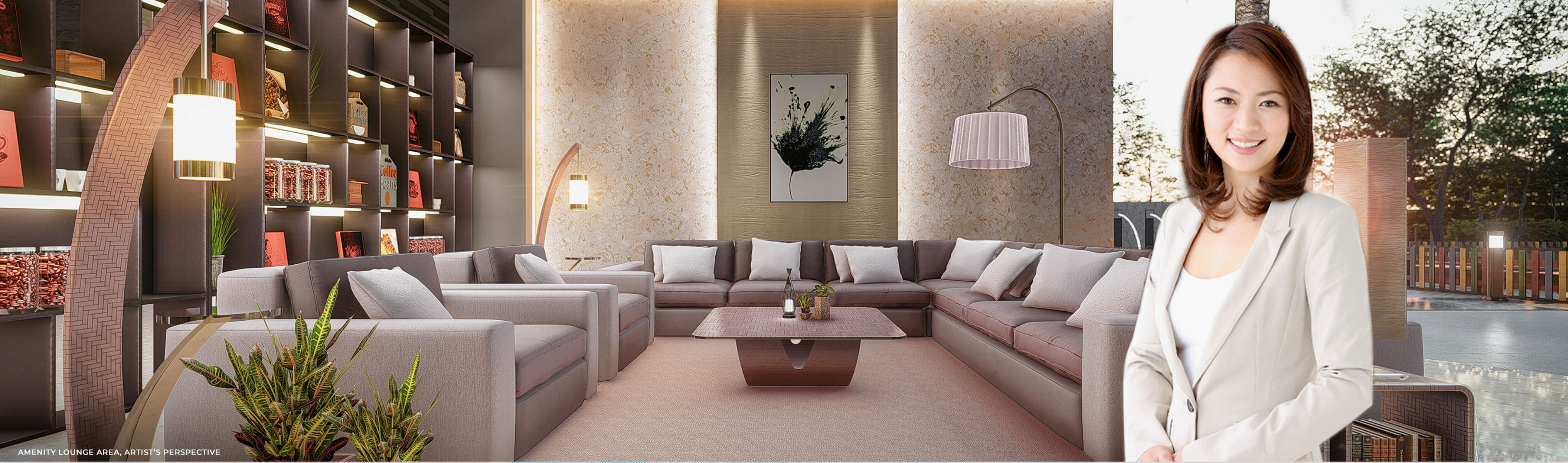
AMENITY LOUNGE AREA, ARTIST'S PERSPECTIVE