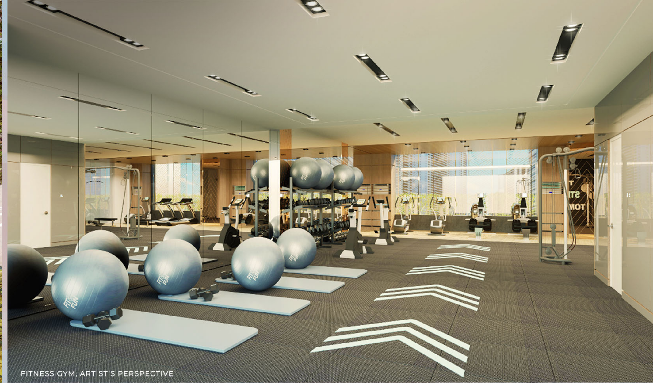
FITNESS GYM, ARTIST'S PERSPECTIVE